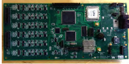
KMS-820 CPU board